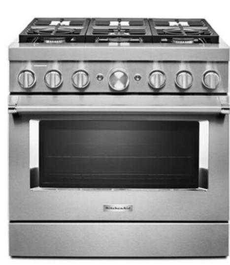
KITCHENAID 36" GAS RANGE