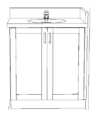
CALACATTA LAZA QUARTZ COUNTERTOPS