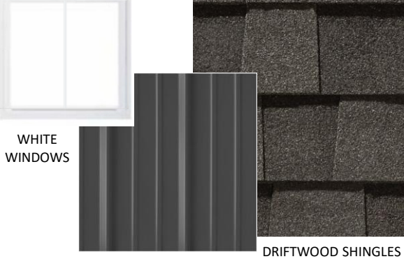
CHARCOAL METAL ROOF ACCENT