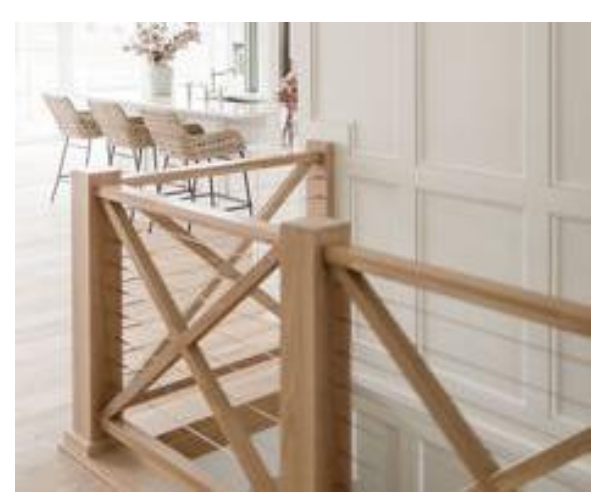
WHITE OAK STAIR RAILING