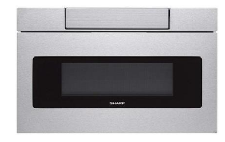
SHARP 30" MICROWAVE DRAWER