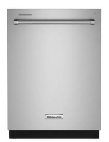
KITCHENAID 24" DISHWASHER