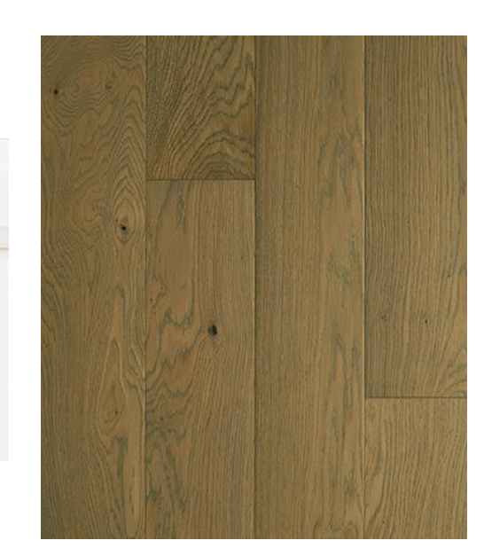
PALMETTO ROAD MONET PARIS HARDWOODS