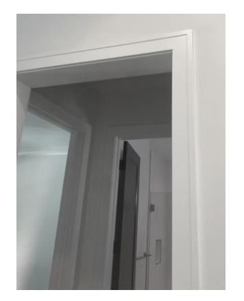
DOOR & WINDOW CASING